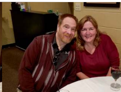
Fire House Grille & Pub Willoughby Hills September 26