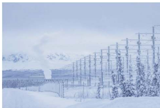
A frosty landscape surrounds antennas at the High-frequency Active Auroral Research Program site in Gakona, Alaska, on December 20, 2022.

The University of Alaska Fairbanks (UAF) operates HAARP under an agreement with the Air Force, which developed and owned HAARP but transferred the research instruments to UAF in August 2015.