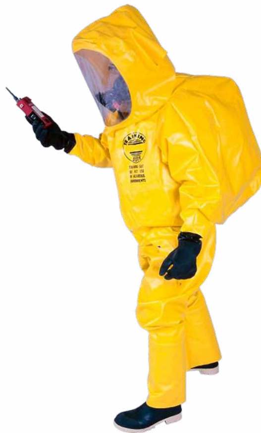
Unvaccinated Ham operator (CO5ID) getting ready for the next Covid Mutation.

Until next month , talk on the radio and use the repeaters. Join us on the air, online, or in person. If you haven't already, get your vaccine shots. Things are gradually getting back to normal. We really want to see or at least hear from you.