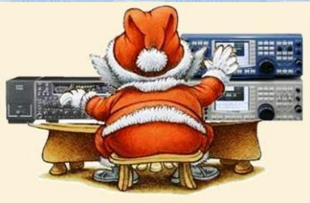
Puzzle 6 (Medium, difficulty rating 0.56)