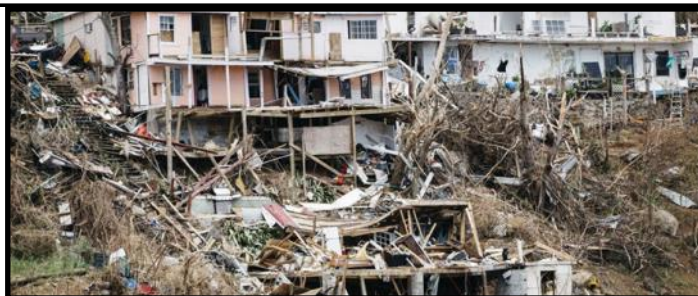
Above, hurricane damage at Cruz Bay in the US Virgin Islands in September, 2017,