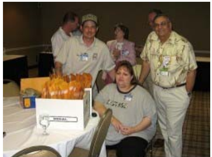
N8IS - W8HBI - K8CMP