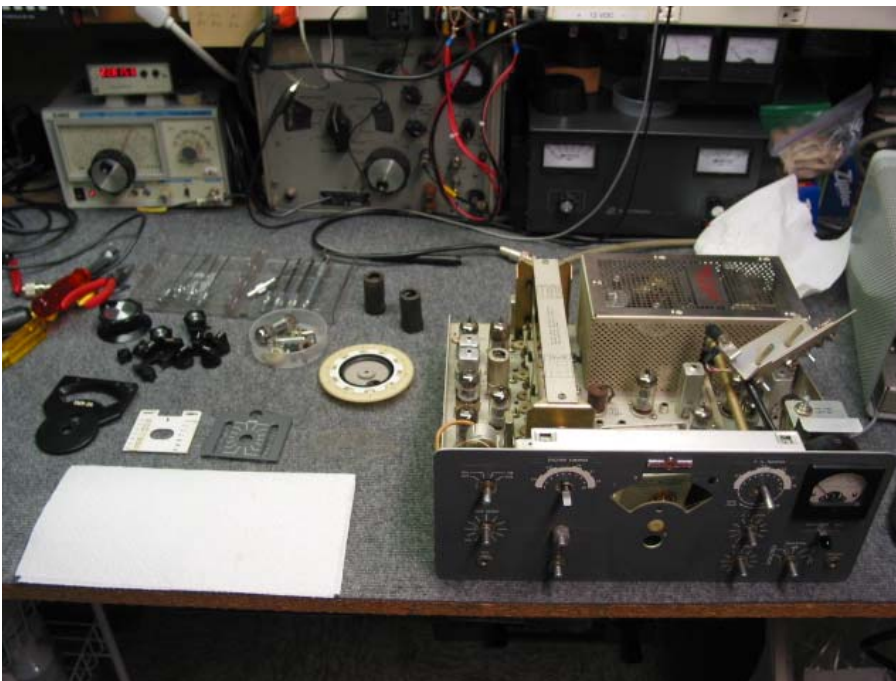
One of Jeff's latest projects—a piece of vintage Collins gear, on the

The high point of the evening came when Jeff suggested, to the amazement of all, that some of the older rigs were best cleaned in the driveway, with a garden hose. Everyone was somewhat taken aback, until Jeff explained that not only would he remove all tubes and other removable components, he would allow SEVERAL days for the interior of the radio to dry before attempting to bring it back online.