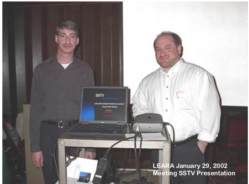
LEARA January 29, 2002 Meeting SSTV Presentation

Bill and Mike also talked about the LEARA 2-Meter FM SSTV Net they run on Saturday Nights at 10 PM local time on the 146.880 repeater and finished up by showing those in attendance pictures from the net. The pictures elicited a lot of comments and laughter from the group. For more information on the net or to see the net pictures yourself you can visit the net's Yahoo e-Group at: http://groups.yahoo.com/group/learasstv