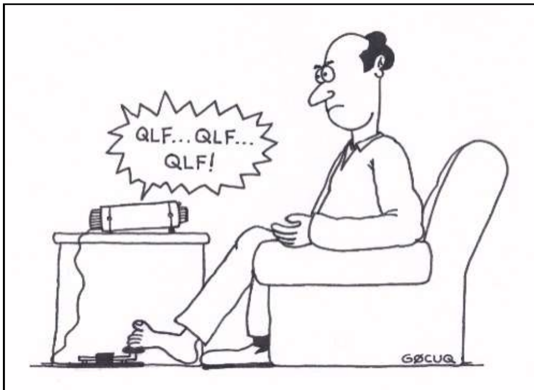
QLF— "Try sending with your LEFT foot!"

In addition, Radio Club members will be operating an Amateur Radio Special Event Station, W2RCA. The Club will be running a station remotely via an Internet connection, and several Radio Club members not attending the Centennial Gala will be operating with the W2RCA call-sign from their home stations from Friday afternoon 1900Z (Nov. 20) through Sunday afternoon 1900Z (Nov. 22). Operations will be on CW and SSB on 80 thru 20 (and higher if the bands open!) -AR-